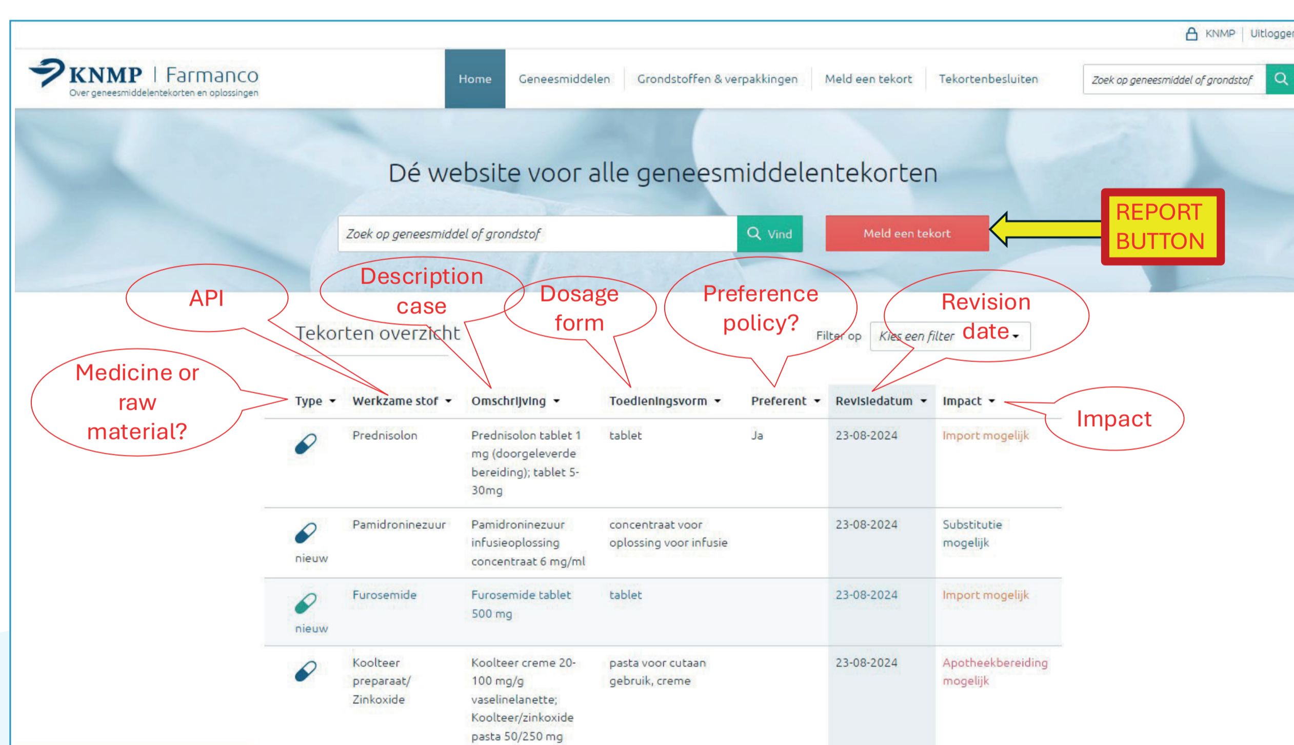
Figure 1: Homepage of KNMP Farmanco